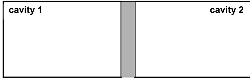
Two coupled photonic micro-cavities

Consider a system consisting of two identical microcavities, labeled as 1 and 2, as shown in the cartoon figure below. The cavities are coupled in the sense that photons initially present in one cavity can “tunnel” into the other cavity, and vice versa. It is the photonic version of the coupled quantum well problem. Each cavity supports only a single mode of the electromagnetic field of frequency \omega_0 . In integrated micro-photonics such coupled cavities are obtained by evanescent coupling of fields between the cavities.